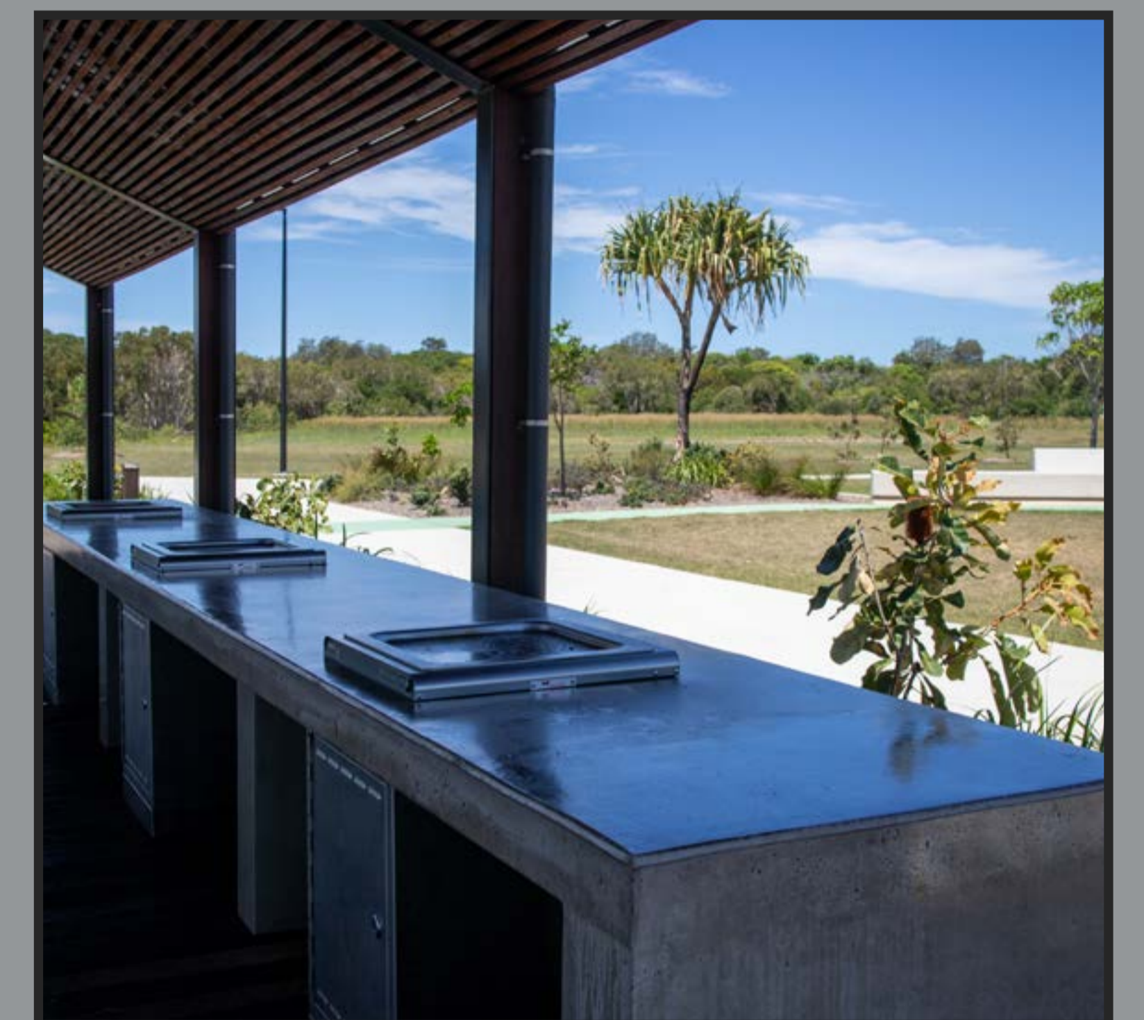
> BBQ's and modular restrooms