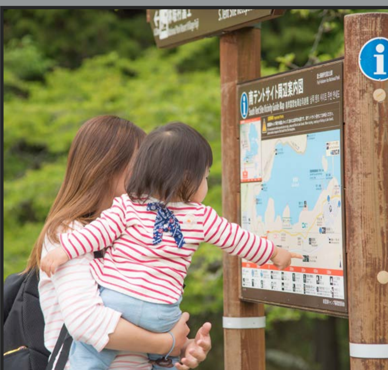
> Signage Decorative, specialised and LED