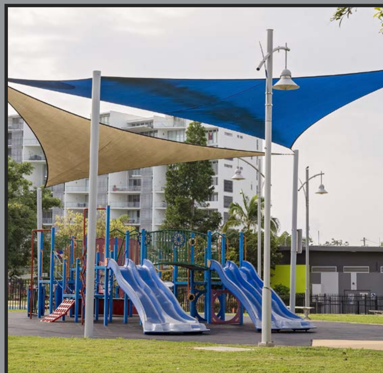
> Shade sails and gazebos